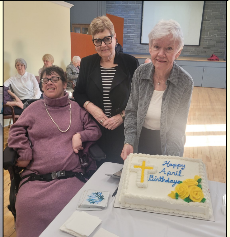
Celebrating birthdays in April :