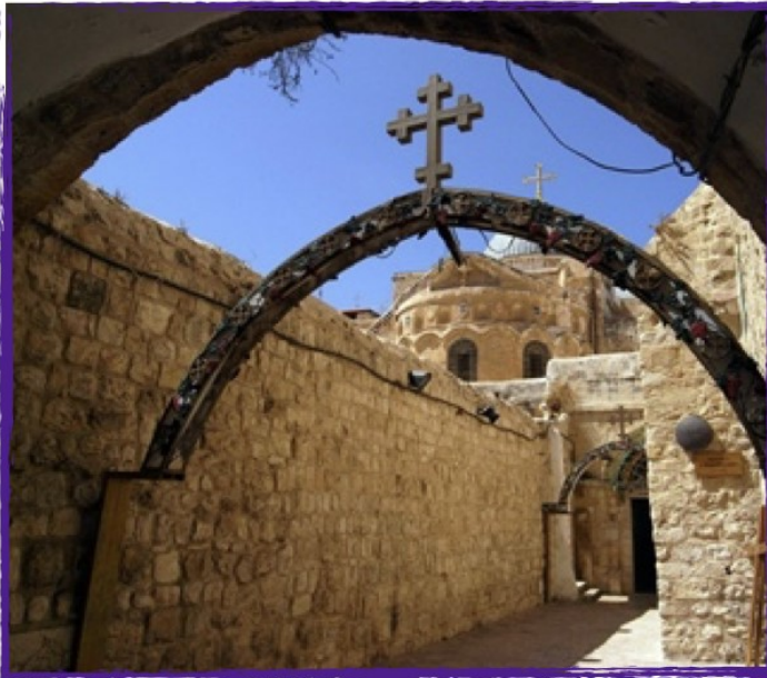
Via Dolorosa

Sundays 7pm - 9 pm EST | February 22 - March 29, 2026